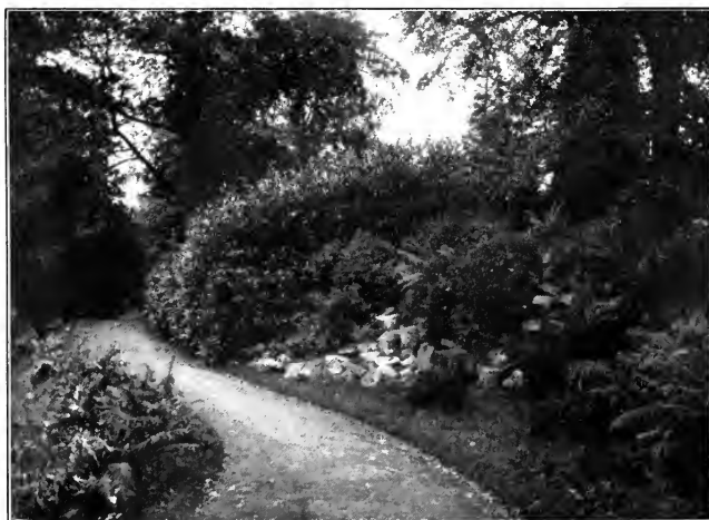
THE DEAN'S WALK AT GOSFORD CASTLE